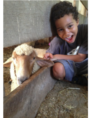
Farm Camper visiting with the sheep during Animals week

In 2016, we plan to extend the scholarship offerings. We will also pilot a Counselor-in-Training Program, to provide opportunities to youth between ages 13 and 17, extend before and after care to all campers, and increase the number of weeks of summer camp available.