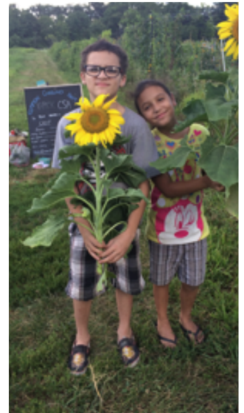
Campers participating in U-Pick Program