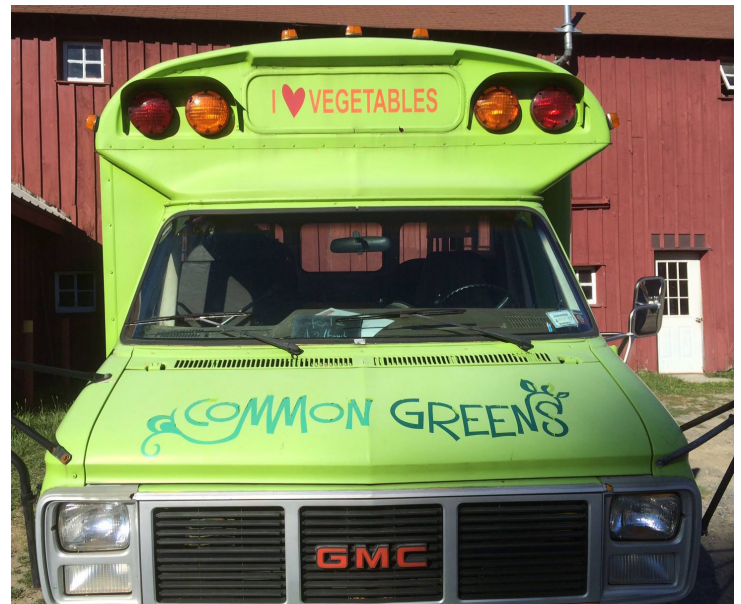
The Common Greens Mobile Market travels to low-income neighborhoods in Beacon in its iconic repurposed green school bus.

The Mobile Market also serves as job skills training platforms for the youth in the Green Teen Program. The teens are trained by our farmers in market retail display and set up, customer service, and financial transactions, and are given additional responsibility throughout the season in regard to managing the market stops. Working closely with the Green Teen program staff, we have developed a market, retail, and agricultural skills training curriculum that includes teens working with our staff on the farm, in addition to our regular weekly stand at the larger and more diverse Beacon Farmers Market.