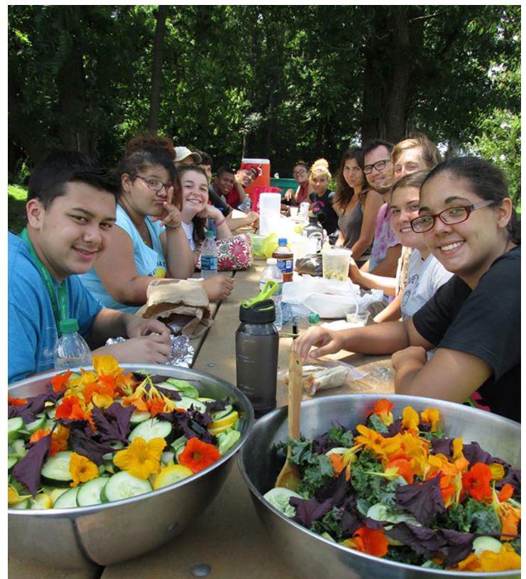
CGF Farm Staff share lunch with Green Teens after spending the morning volunteering on the farm.