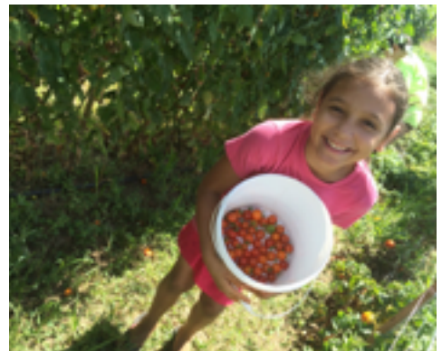
A Farm Camp scholarship recipient picks cherry tomatoes as part of her family's U-Pick share.