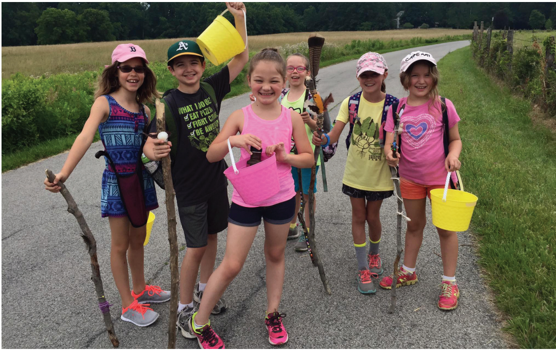
Outdoor Skills Campers foraging wineberries to make into jam