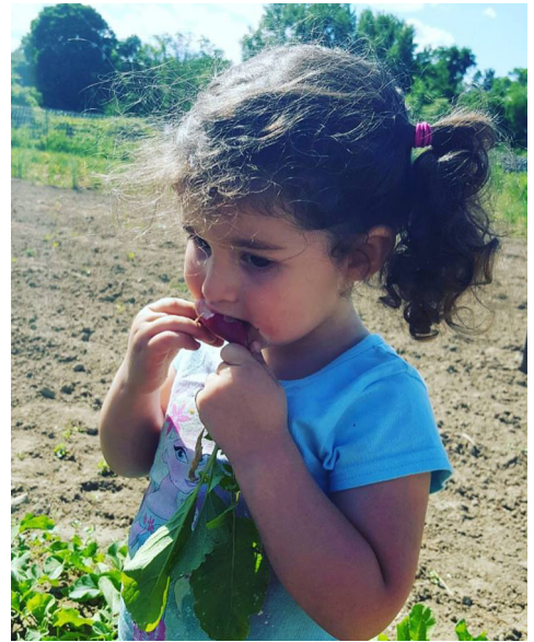
Students visit the farm and harvest radishes directly from the field.

The farm collaborated closely with the education programs, leading field tours for visiting school groups as well as weekly activities with Farm Camp. Children in these programs were able to directly experience the farm by coming out into the fields to harvest, then preparing a snack made with the vegetable they just picked. In the coming year we plan to collaborate with local schools to serve farm-fresh produce into the school cafeterias.