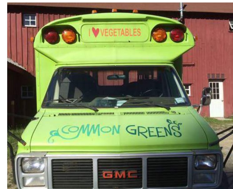
The Common Greens Mobile Market travels to low-income neighborhoods in Beacon in its iconic repurposed green school bus.

Common Ground's Greens 4 Greens Program doubles the value of a customer's food assistance benefits (SNAP/EBT, FMNP, WIC), used to purchase produce at the market. For every $4 spent, the customer receives a $4 coupon for more fruits or vegetables at farm stands and markets. With 50% of all market revenue coming from food assistance, the success of the Greens 4 Greens program demonstrated that those individuals and families receiving food assistance were eager for more ways of accessing fresh, healthy foods. In 2016, we were able to manage and expand food access at the Beacon Farmers' Market, making SNAP/EBT benefits accepted throughout the market, and growing the Greens 4 Greens nutrition incentive program to provide low-income families with over $3,000 of produce from local farms.