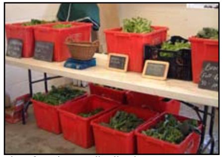
Bins of produce at distribution