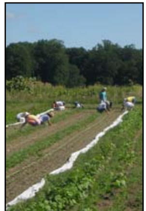
Working in the field